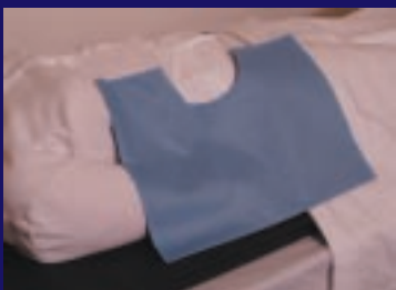
D-110 X-Drape™ 12"x17" sterile disposable X-ray Shield 0.25 mm lead equivalent with cutout. Comes with 36"x36" sterile overwrap.

Exposure to scattered radiation is directly linked to long term health problems and is clearly one of the most serious occupational hazards, that those using X-ray Fluoroscopy face each day. The closer you are to the primary beam, the closer you are to the source of scatter radiation. Alarming, an increasing number of procedures require the Clinician to be in extremely close proximity to the primary beam, causing exposure levels to exceed safe practice guidelines. Reducing your exposure to Scatter Radiation is of the utmost importance, but how? Personal shielding such as leaded glasses and eyewear certainly help, but what about additional shielding?