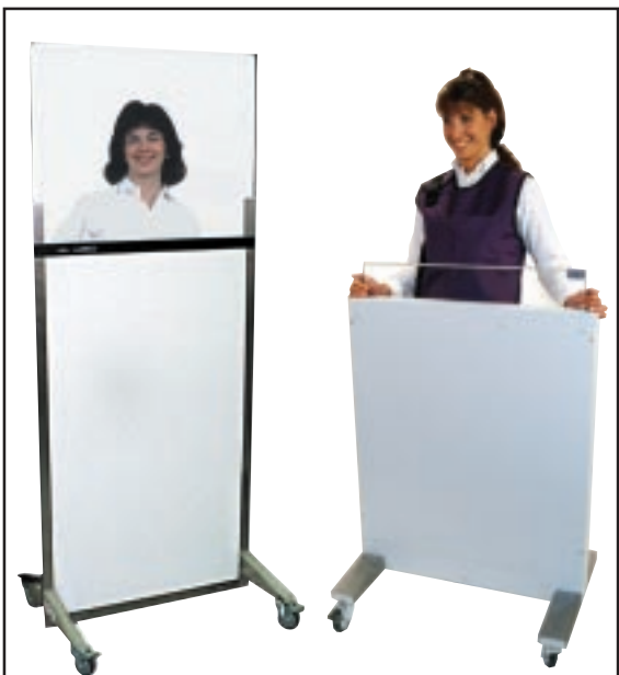
A Broad Range of Rayshield® Mobile Barriers includes Custom Sizes . . .

AADCO Medical, Inc., warrants the Overhead Barrier & Equipment Suspension Systems manufactured under it's RayShield® trademark to be free of defects in material and workmanship for the life of the product. Repair or replacement of equipment parts will be done at the sole discretion of AADCO Medical, Inc, upon a no-charge basis and subject only to normal shipping and handling charges. This warranty assumes normal wear and tear and does not cover any product which has been improperly installed, abused or misused. This warranty represents the only warranty provided by AADCO Medical, Inc, for these products. AADCO Medical, Inc., assumes no liability other than that expressly set forth in the foregoing warranty. No other warranty, whether express or implied, is provided. In no case shall the liability of AADCO Medical, Inc., exceed the purchase or replacement price of the product.